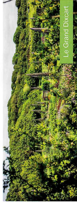
Le Grand Dixcart

Saturday 24th Government House Longfrie House